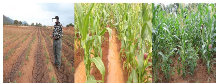
Plate 2. Maize planted on tied ridges