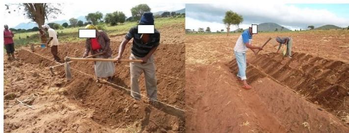
Plate 1. Land preparation, construction of tied ridges and planting

The soils' pH values for the two sites were 5.2 (mild acidic soil reaction) (Table 1). The optimum soil pH for maize plants is 6.0 to 6.8 [21]. The observed soil pH value might not favour the formation of diphosphate ions ( \text{HPO}_4^{2-} ), and also will not increase the activity of \text{Ca}^{2+} which reacts with \text{HPO}_4^{2-} to form insoluble calcium diphosphate and hydroxy-apatite. However, it has been reported that cultivation of maize is even possible in soils with pH of 5.0 although yield levels will not be that much high because of low exchangeable bases and P fixation by Al and Mn [22]. Based on the soil pH hence the soil reaction (mild acidic), the soils of Mwanga and Same districts are suitable for maize cultivation.