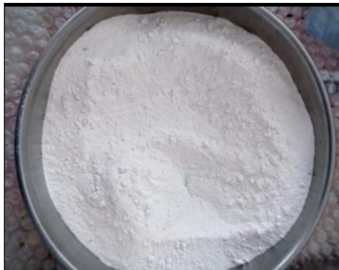
Fig. 2. Marble dust used for the study

From these tests optimum content of waste paper sludge and Marble dust that improved properties of soil will be obtained. For the optimum amount consolidation test is performed.