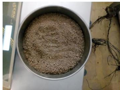
Fig. 1. Waste paper sludge used for the study

Waste Paper Sludge (WPS) is a solid waste material collected from the Paper recycling Industry. It is the end product obtained from pulping and removing of impurities several times. Waste paper sludge used for this study is brown in color and has pH value of 8.75, which is slightly basic. Specific gravity of Waste paper sludge is 2.3.