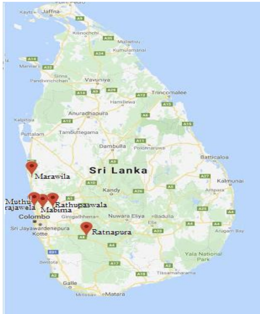
Fig. 3. Sampling sites where representative soils were collected from