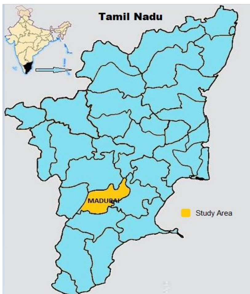
Fig. 1. Map highlighting the study district of Tamil Nadu