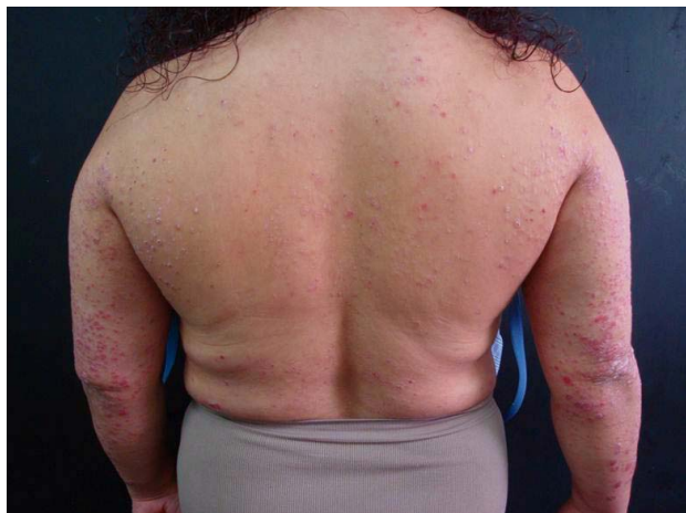
Figure 1. Severity of psoriasis (PASI 13.5) at the beginning of treatment with adalimumab.