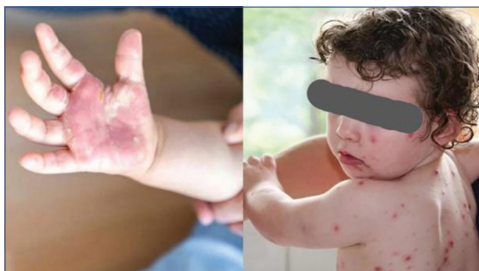
[Table/Fig-3]: Blisters and rashes in tomato flu-affected patients [21].