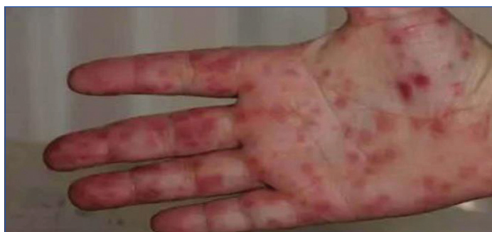
[Table/Fig-2]: Rashes in tomato flu-affected patients [20].

The characteristic rashes are shown in [Table Fig-3,4] [20,21].