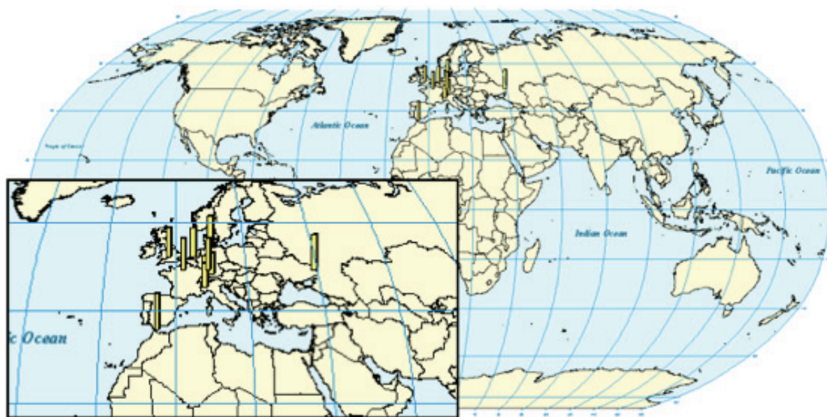
Figure 4. Interconnection geographical distribution at the TOPIX.