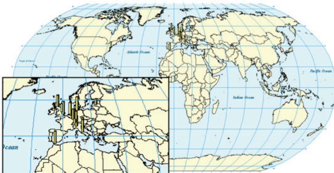
Figure 3. Interconnection geographical distribution at the NAMEX.