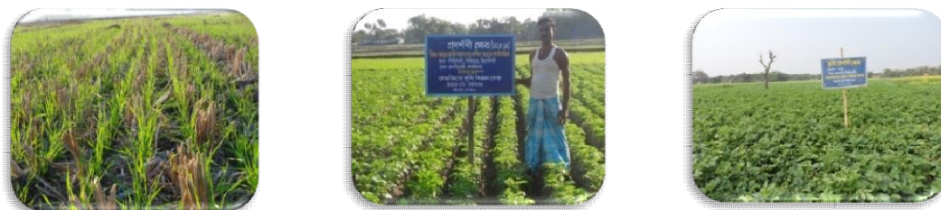
Plate 1. Experimental centre for wheat and potato