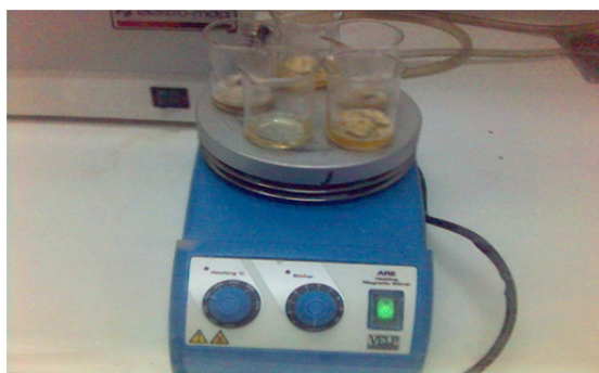
Figure 4. Boiling samples in the ICP device

(Magnetic Stirrer) until they became liquefied (Image 2). After the burning process was complete, the samples were left to cool.