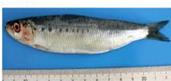
Figure 3. Sardine Sample from Soros Bay

In order to analyze the samples, firstly wet weights then dry weights were obtained. With the help of a bistoury, pieces were taken from the samples and the dry weights were determined. Lam weights are also measured and noted.