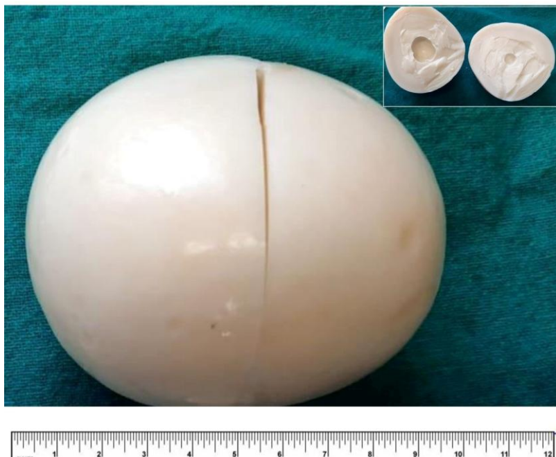
Fig. 1. Gross image of peritoneal loose body measuring 10x10x7cm with white and shiny surface. Inset-Cut section of peritoneal loose body with calcifications surrounded by white laminated periphery

lamellated appearance and dense calcified core of size 8.1x8.5x8.6 cm in mesentery of left iliac fossa. A differential diagnosis of peritoneal loose body, gastrointestinal stromal tumor (GIST), mesenteric calcification and fibroma was made on radiology. Patient underwent exploratory laparotomy. A hard loose object with the appearance of a boiled egg was found in the lesser pelvis. On manipulation, it freely floated through the abdominal cavity without any connection or adherence to the surrounding tissue. Finally, giant peritoneal loose body was extracted and sent for histopathological examination. On gross examination, PLB was white, elliptical shaped with smooth surface and measured 10x10x7cm (Fig. 1). It was hard to cut and showed calcifications surrounded by white laminated periphery. Histopathological examination showed that it was composed of laminated hyperplastic fibrillar collagen with microcalcifications and it was reported as consistent with peritoneal loose body (Fig. 2). After an uneventful postoperative course, the patient was discharged from the hospital after 3 days in excellent condition. Four weeks postoperatively, the patient's chronic symptoms have completely disappeared.