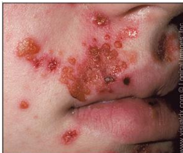
Figure 1. Honey-colored crust of nonbullous impetigo.