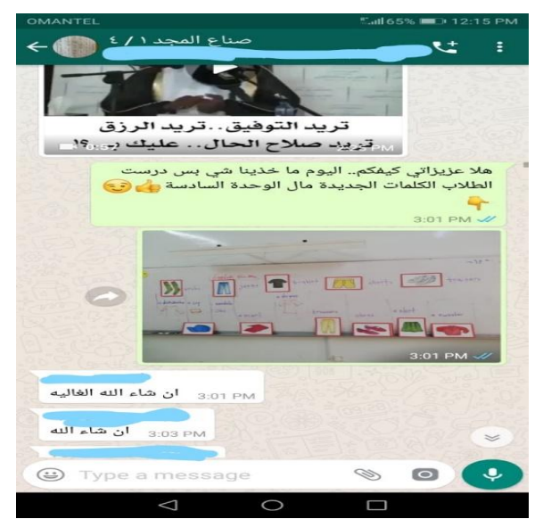
Teacher sharing the information on the material of the lesson she taught to the mothers