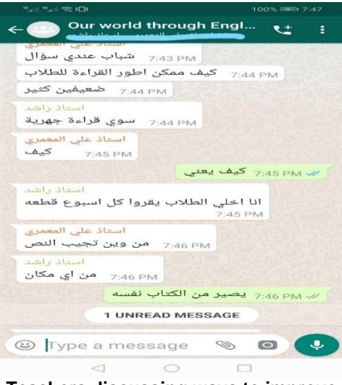
Teachers discussing ways to improve students` reading