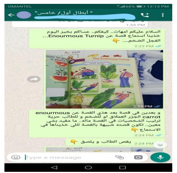
Teacher sharing the information on what she taught and what the students need to prepare