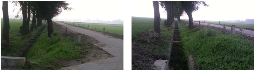
Fig. 2. A new road prevents the flow of water and exacerbates flooding in low-lying areas, Yen Ho commune