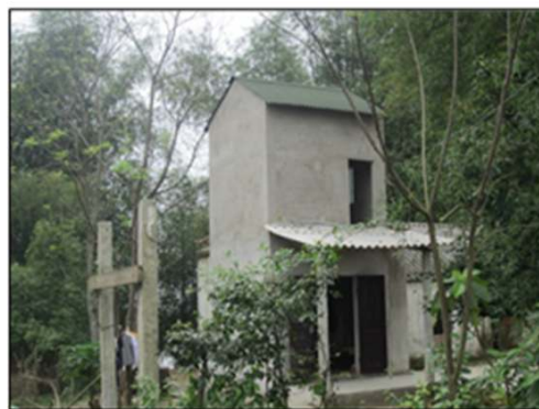
Fig. 4. Chòi (hut) for cows and buffaloes in Hung Nhan