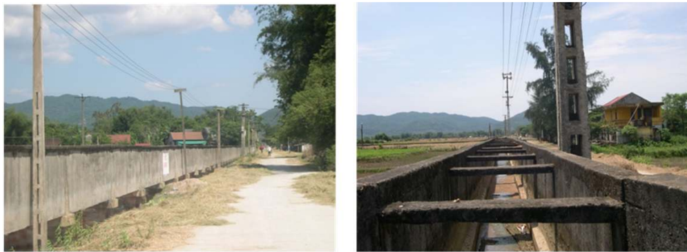
Fig. 3. At-surface ditch, Hung Nhan commune