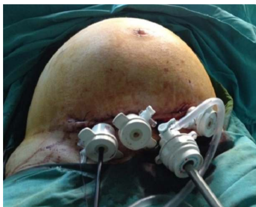
Fig. 1. Appearance of the abdomen after closure of the fascia and skin between the cannulas and insufflation with CO 2

incision, a male infant with Apgar scores of 9 and 10 and weighing 3150 g was delivered. Through the Pfannenstiel incision, proceeding from the patient's right to left, 4 empty cannula sleeves of diameters 5 mm, 5 mm, 10 mm and 5 mm respectively, were inserted into the abdominal cavity (Fig 1). For maximal freedom of movement of the cannulas, 3 of them were of the 5 mm type having smaller heads than the 10 mm type, and the cannulas were spaced evenly along the incision. In order to seal the abdomen temporarily for CO 2 insufflation, the cannulas were held in place while the fascia between them was closed with interrupted sutures, and then the skin between the cannulas was similarly closed. Insufflation was performed to 12 mmHg, and no leakage was apparent.