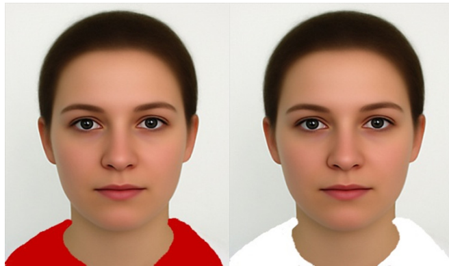
Figure 1. A sample image for each color manipulation. In each image, the female illustrated was the same; only the color of her shirt differed (red or white)

Participants completed a survey packet containing 4 images of the same female wearing either a red or a white shirt. The only difference in the images was the color of the shirt that the female was wearing (red or white). White in this case was used as the ‘neutral’ color. A sample of each image is given in Figure 1. Each image had an attached vignette in which the female was described as eating a healthy food or an unhealthy food. The healthy food vignette stated: Anna had an hour break for lunch. She decided to purchase a fresh salad from the local café. The unhealthy food vignette stated: Anna had an hour break for lunch. She decided to go to McDonald’s, where she purchased a double cheeseburger and French fries. Each vignette was included for the female wearing the red shirt (red-healthy; red-unhealthy), and for the female wearing the white shirt (white-healthy; white-unhealthy).