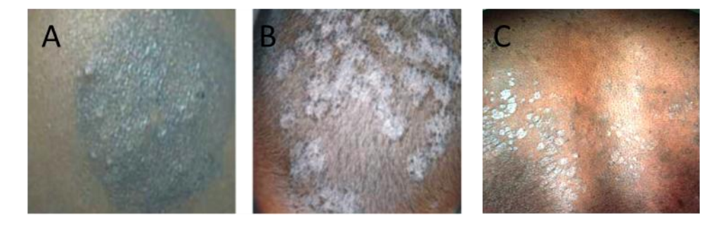
Fig. 1. A: Body ringworm on the upper arm (tinea corporis); B: Ring worm of the scalp (tinea capitis) on human head, and C: Tinea versicolor due to invasion of cornified skin on upper back by Malassezia species

Also, a positive correlation between bodyweights and recurrence frequency of CMs (R= 0.139; p = .02). ANOVA showed that diagnosis of other types of skin infections was an indicative of CMs (p < .01). Seasonal weather changes were attributed to the recurrence of CM ( x^2 = 7.023 , p = 0.03). Most respondents (85.3%; n = 168) reported to had contracted CMs during the hotsummer season than the rest of the year (Fig. 2).